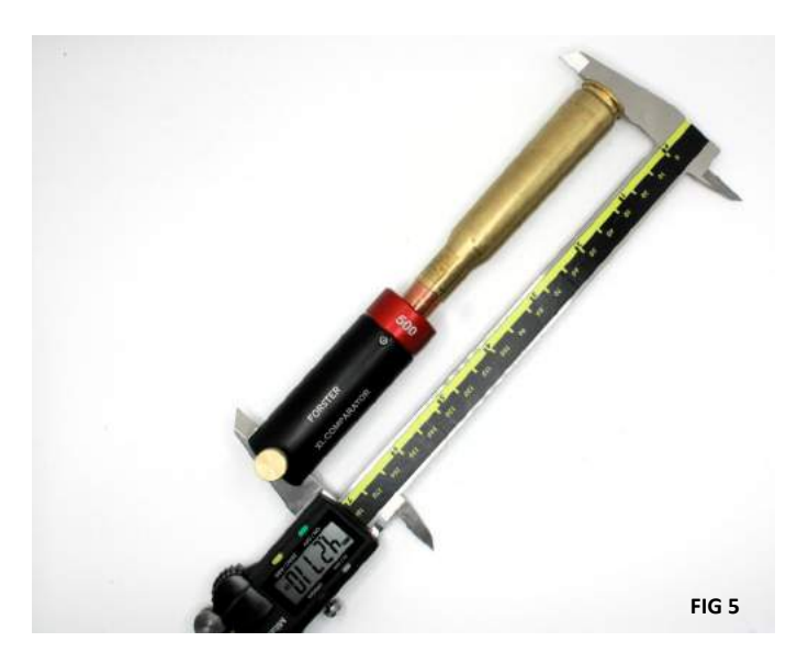
Adjustments to your seating depths can be confirmed using this XL Comparator and with the proper XL Bushing.

When measuring base to Ogive the same setup applies. Secure the correct red colored XL Bushing on the end of the comparator body then perform your measurement as seen below.