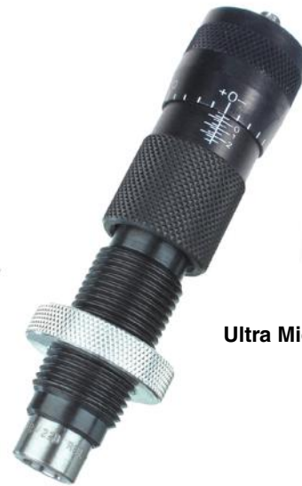
Ultra Micrometer Seater Dies