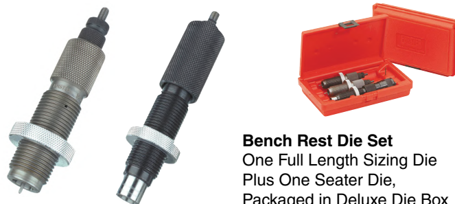
Bench Rest Die Set One Full Length Sizing Die Plus One Seater Die, Packaged in Deluxe Die Box