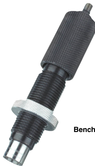
Bench Rest Seater Dies