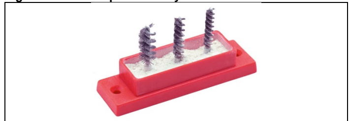
Figure 2. Case Graphiter Ready to Use

If desired for stability, use the pre-drilled mounting holes to fasten the base to a block of wood.