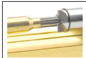
Figure 5. Neck Reamer in Use